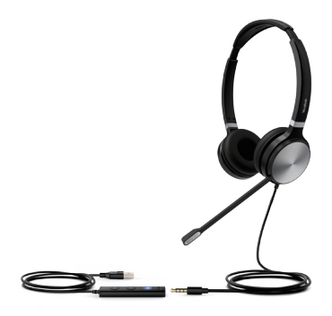
UH36 Dual Teams UH36 Dual UC