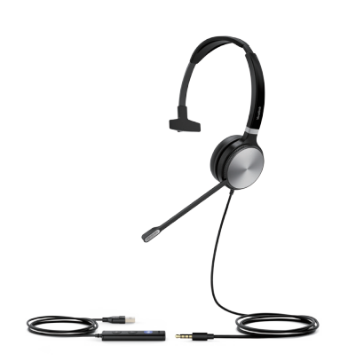
UH36 Mono Teams UH36 Mono UC

* When you use UH36 in some uncertified communication platforms, as a minimum, it works as audio only.